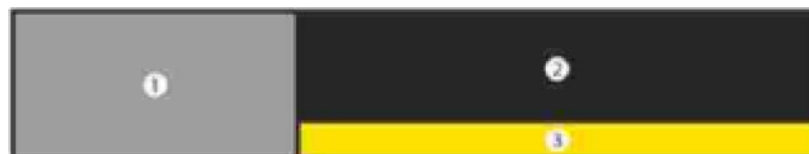
Figure 3- Wide Side-by-Side Pattern: 1. Picture, 2. Text, 3. Cessation message