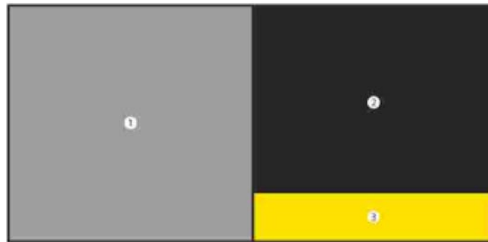
Figure 2- Side-by-Side Pattern: 1. Picture, 2. Text, 3. Cessation message