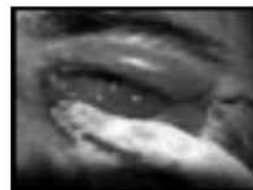
SMOKING CAUSES CATARACTS AND BLINDNESS