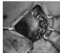
SMOKING CAUSES HEART DISEASE;