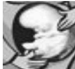
SMOKING IS DANGEROUS TO THE UNBORN BABY