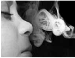
SMOKING IS DANGEROUS TO YOU AND NON-SMOKERS