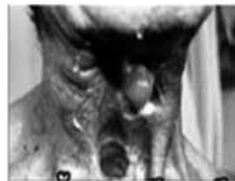
SMOKING CAUSES THROAT CANCER