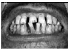
SMOKING SPOILS YOUR TEETH