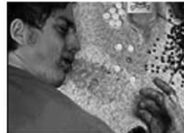
SMOKING IS DANGEROUS TO YOUR HEALTH