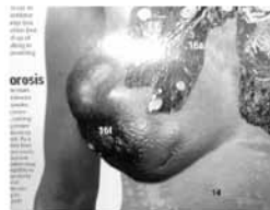
SMOKING CAUSES BREAST CANCER