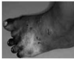
TOBACCO SMOKING CAUSES DISEASES