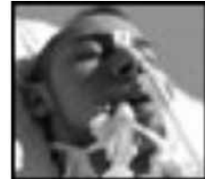
TOBACCO SMOKING KILLS