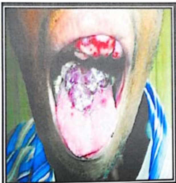
Smoking causes tongue cancer